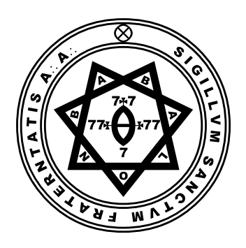
A∴ A∴ Publication in Class A B. Imprimatur:

D.D.S. 7^{\circ} = 4^{\circ} Præmonstrator O.S.V. 6^{\circ} = 5^{\circ} Imperator N.S.F. 5^{\circ} = 6^{\circ} Cancellarius