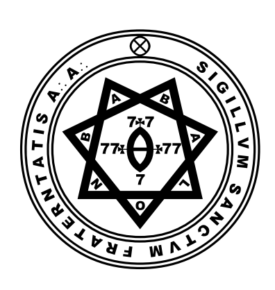
A∴A∴ Publication in Class D