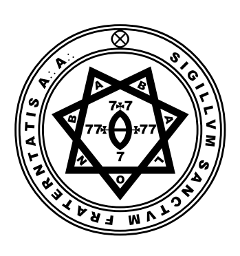
A :: A :: Publication in Class C